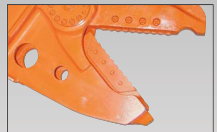
Waved shape cutter

Technical specifications subject to change without prior notice